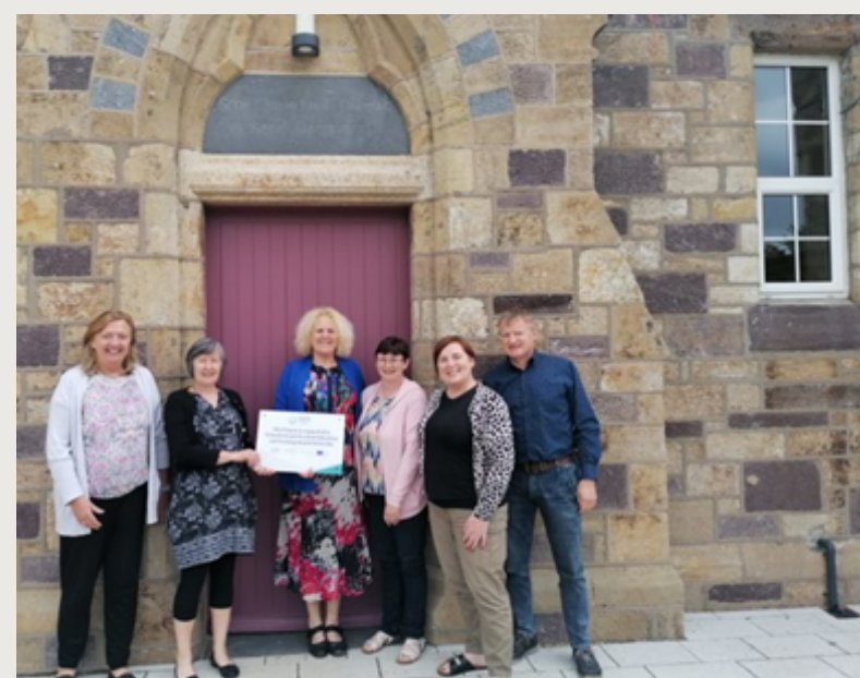
WWETB staff presenting plaque to Clonea Power committee members