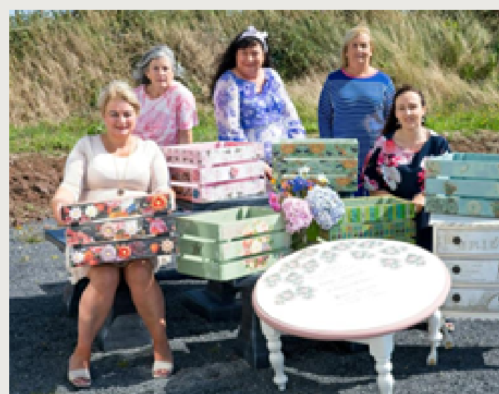
Carbally Community with their finished pieces from the Restore and Reuse Programme

Both communities mentioned above have worked extremely hard to ensure that their community centres remain open, and this is an impressive achievement.